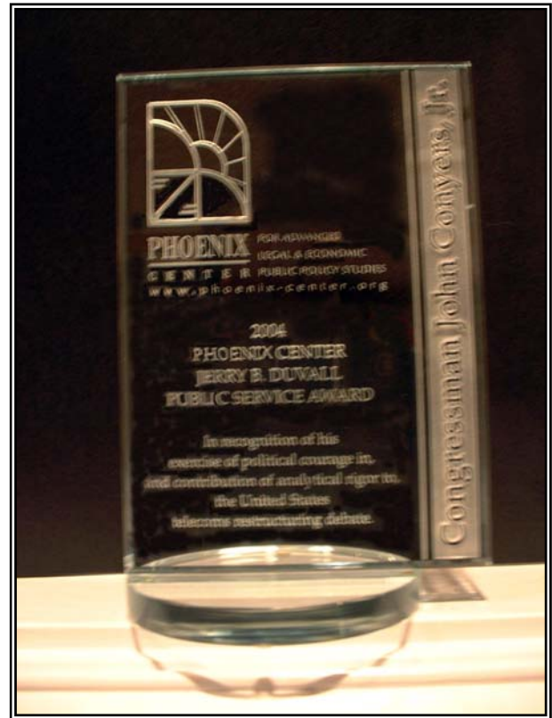
The Duvall Award